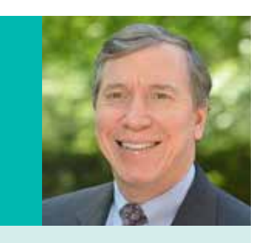
About the author